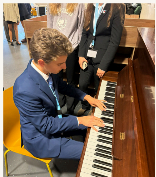
The “bird” playing some tunes