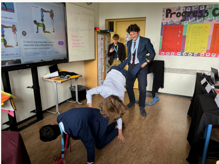
Class time yoga